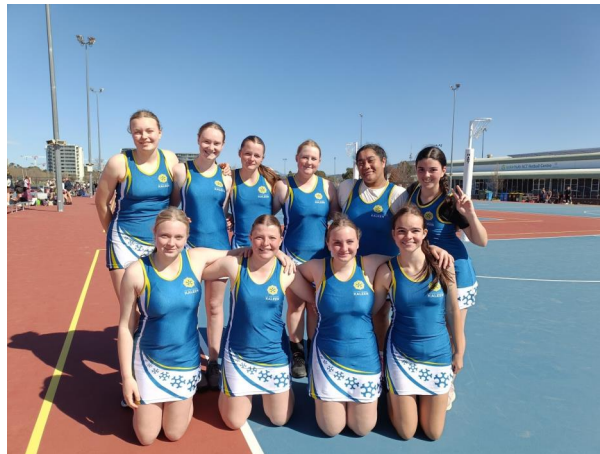
2 - Junior Girls Netball team at the gala day