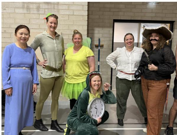
12 - Arts Tech staff - Peter Pan