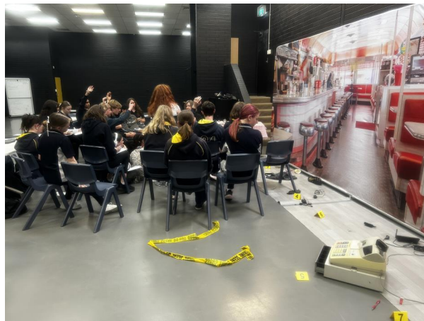
5 - Crime Story Incursion

Outside of regular classroom lessons, the English faculty have been proud to facilitate several enrichment opportunities this term. Our creative writing excursions and links with the University of Canberra have provided valuable opportunities to extend their learning. Twice this term, students from all year levels worked with experienced and publish authors through the UWrite@UC program. In week 5, UCHSK hosted an exciting 'Crime Story' incursion, where a group of Year 9 and year 10 students became detectives to solve a mock crime scene, honing their analytical and creative writing skills. Thank you to the school board who funded this incursion through a board grant, so it was free to all involved.