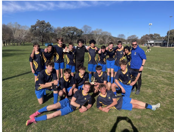
4 - 9/10 Boys Football team at the ACT Finals