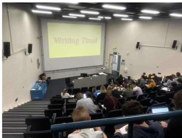
6 - UWrite@UC