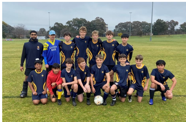
3 - 7/8 Boys team at the Northside Football Gala Day

UCHSK were successful in qualifying for the ACT Football Finals Day, through our Year 7/8 and Year 9/10 Boys' teams. This was a result of positive performances from both teams at the Northside Football Gala Day at Dickson Playing Fields, with the Year 7/8 Boys coming 2nd overall after making the Final, and the 9/10 Boys winning the Final to become Northside Champions. We then qualified for the ACT Football Finals Day, which was played at Mawson Playing Fields. This brought together the Top 2 teams from the Northside and Top 2 from the Southside, to play a Round Robin finals, followed by Semi Finals and ultimately the Final. The 7/8 Boys narrowly lost the Semi Final vs Mackillop on penalty kicks 10-9, but managed to win the 3rd v 4th Playoff, to finish 3rd in the ACT – a great achievement. The 9/10 Boys played Melrose High in the Semi Finals and won 1-0, which qualified them for the ACT Final. After a tight match that finished 0-0, it also went to penalties, with UCHSK overcoming St. Francis Xavier 9-8 to be crowned ACT Champions.